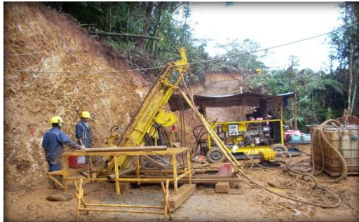
Drilling at Bongara