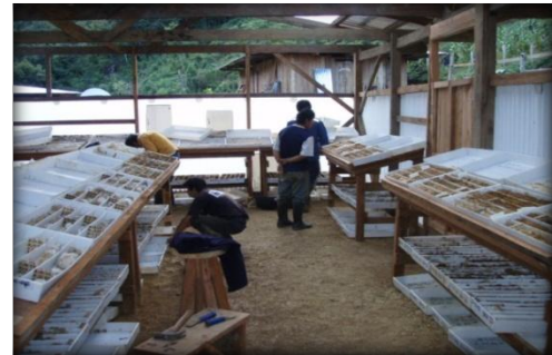
Bongará Core Shack